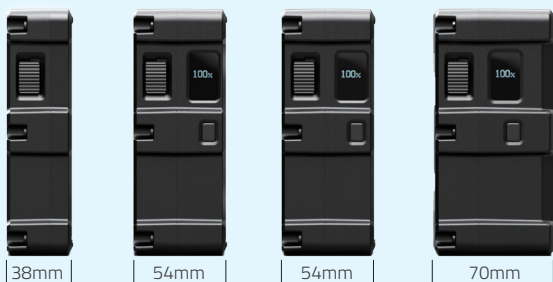
BIVO-98 98Wh BIVO-160 160Wh BIVO-200 196Wh BIVO-290 290Wh